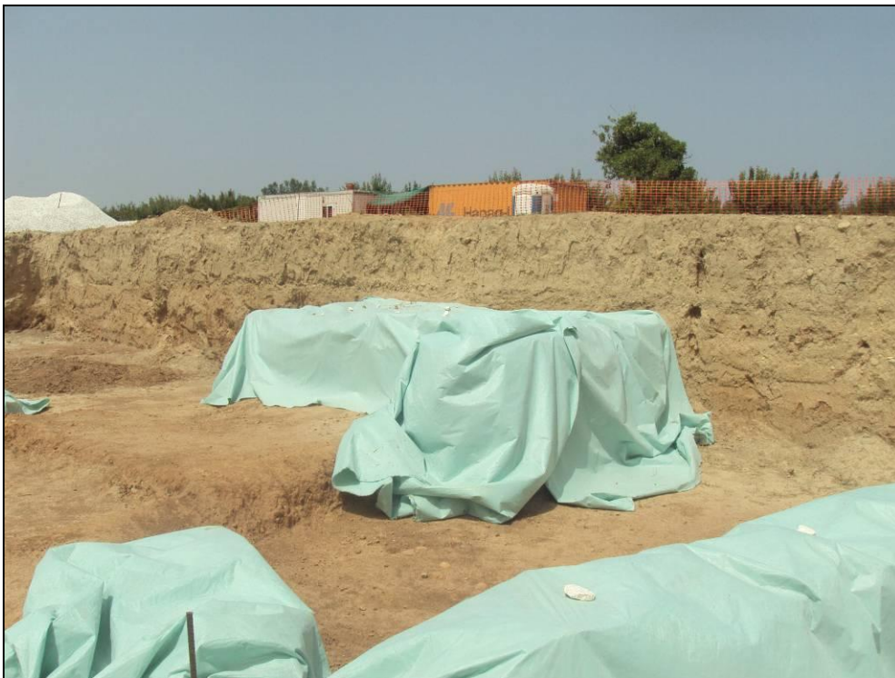
Filling of archaeological sections C.H. 17+000, at Ancient Sykiona