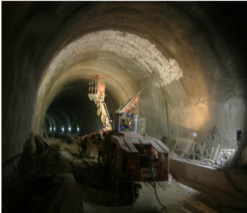
Tunnel T15 CH 68+000