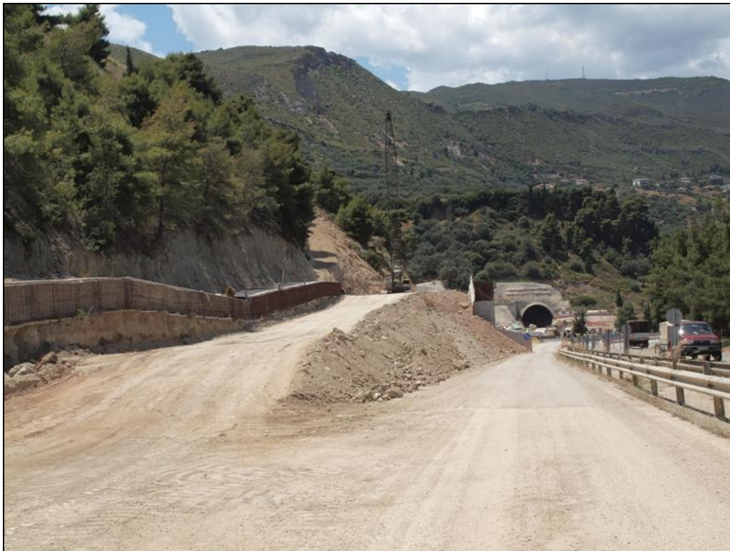
Earthworks for the construction of Platanos Lane Cover C007