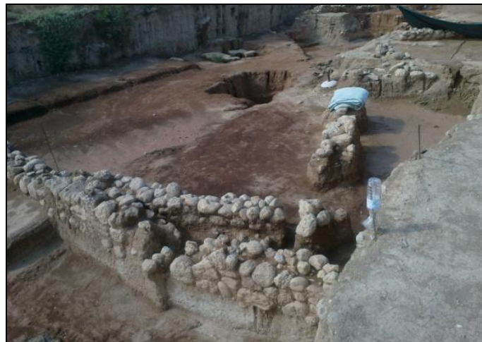
SIKYONA (MOULKI) K.P. 17+100 KO-PA section Architectonical ruins excavation

Works in the positions indicated in the Concession Agreement (article 13.1) and where there is a great potential of Antiquities being revealed have commenced.