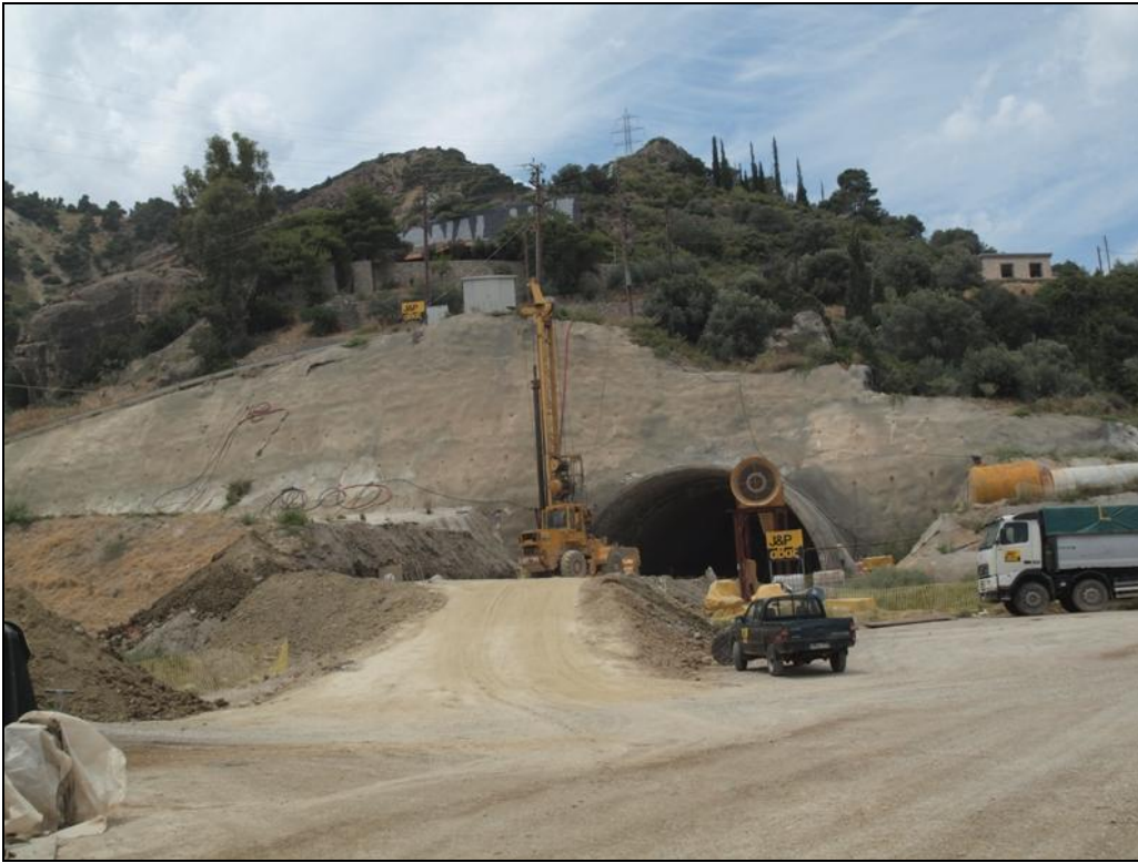
Construction of piles at east portal of Tunnel T11