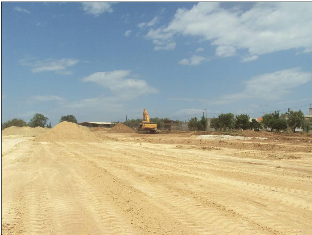
General excavations at Zevgolatio New toll station