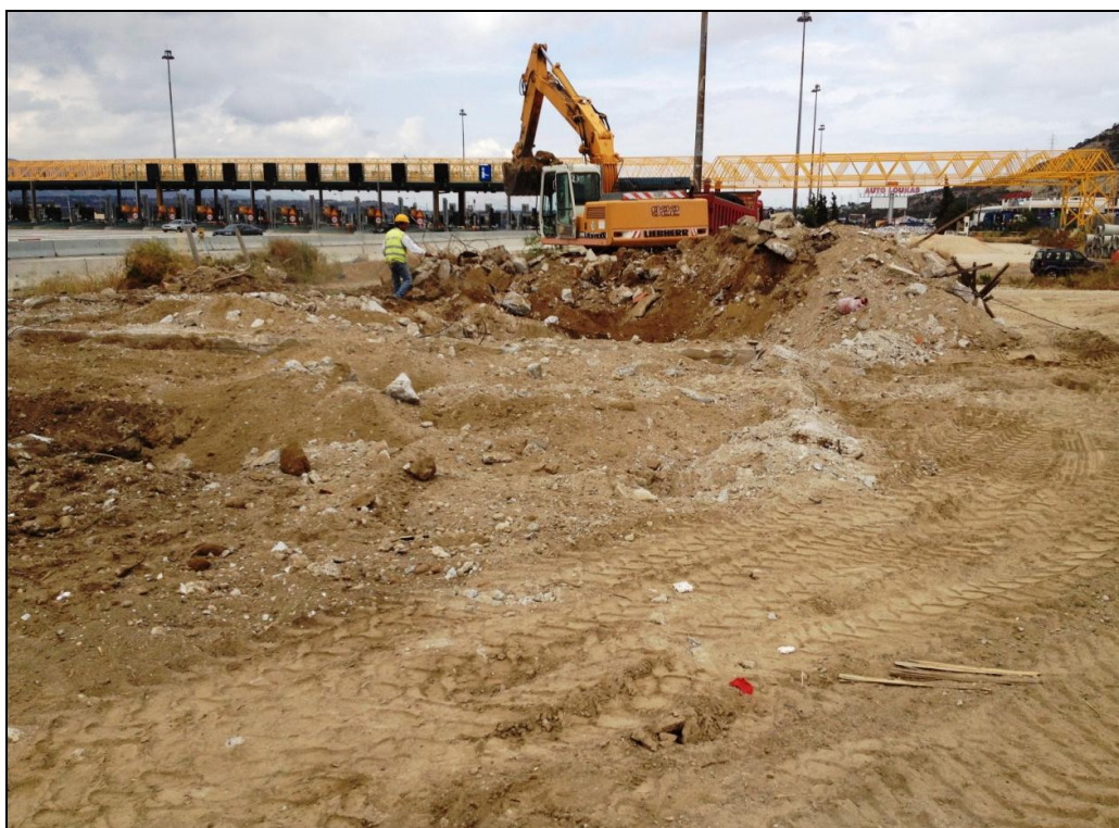
Isthmos toll station–transportation of disposed materials