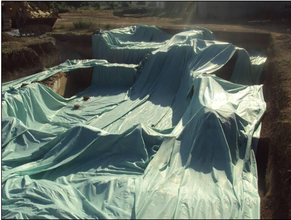
Filling of archaeological sections C.H. 18+500, New toll station