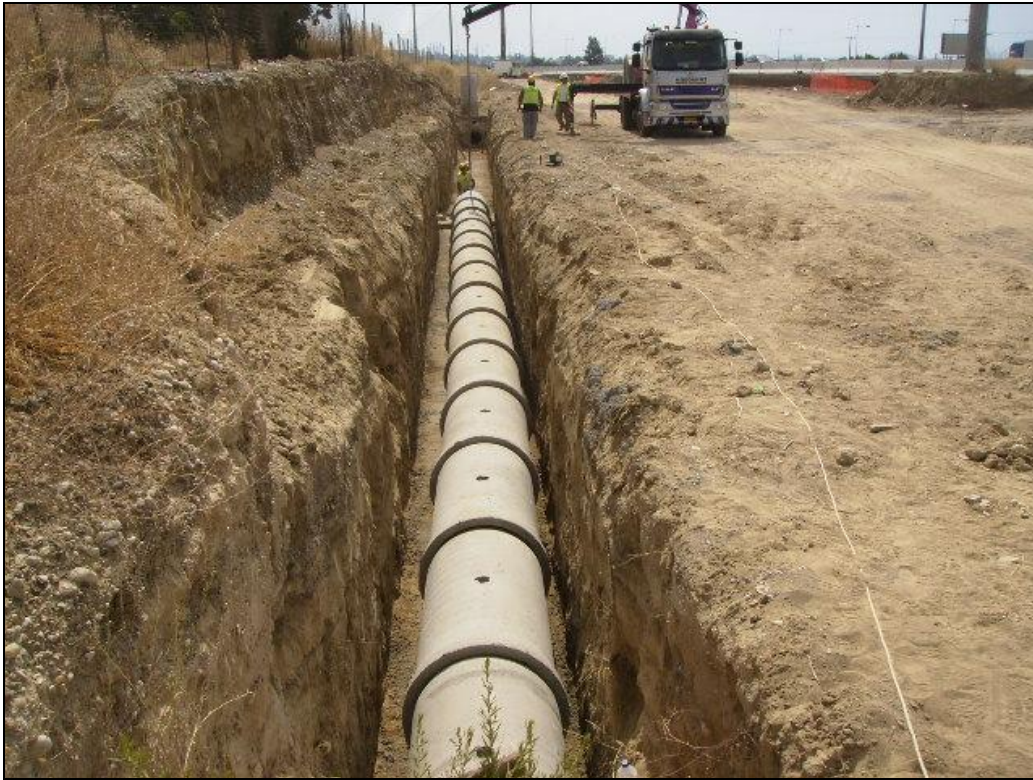
Isthmos toll station–placement of the new stormwater pipe