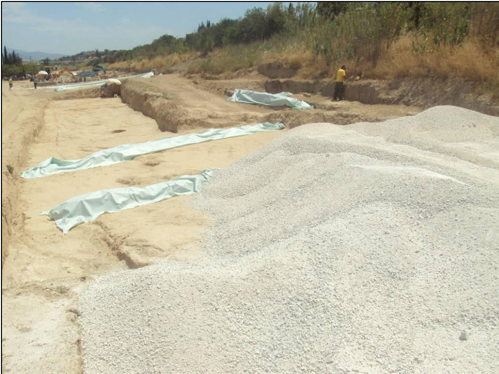
Filling of archaeological sections C.H. 1+700 – 1+972, at Ancient Korinthos