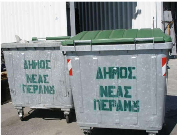
Nea Peramos OMC

The respective “Hazardous Materials Selection and Procurement Procedure” has been prepared describing all the constructor’s actions contributing to the prevention of the uncontrollable use of hazardous materials during the Project’s construction period.