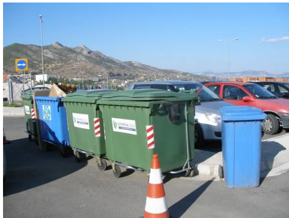
Nea Peramos OMC