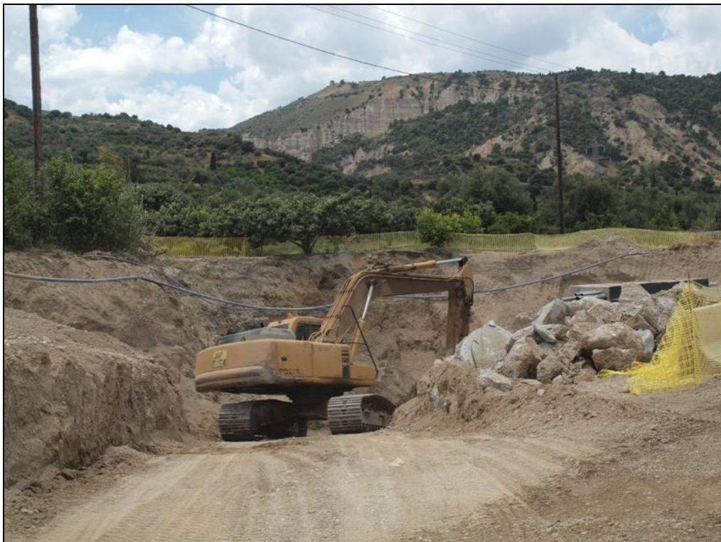
Excavation works for the construction of Rozena bridge (B245)