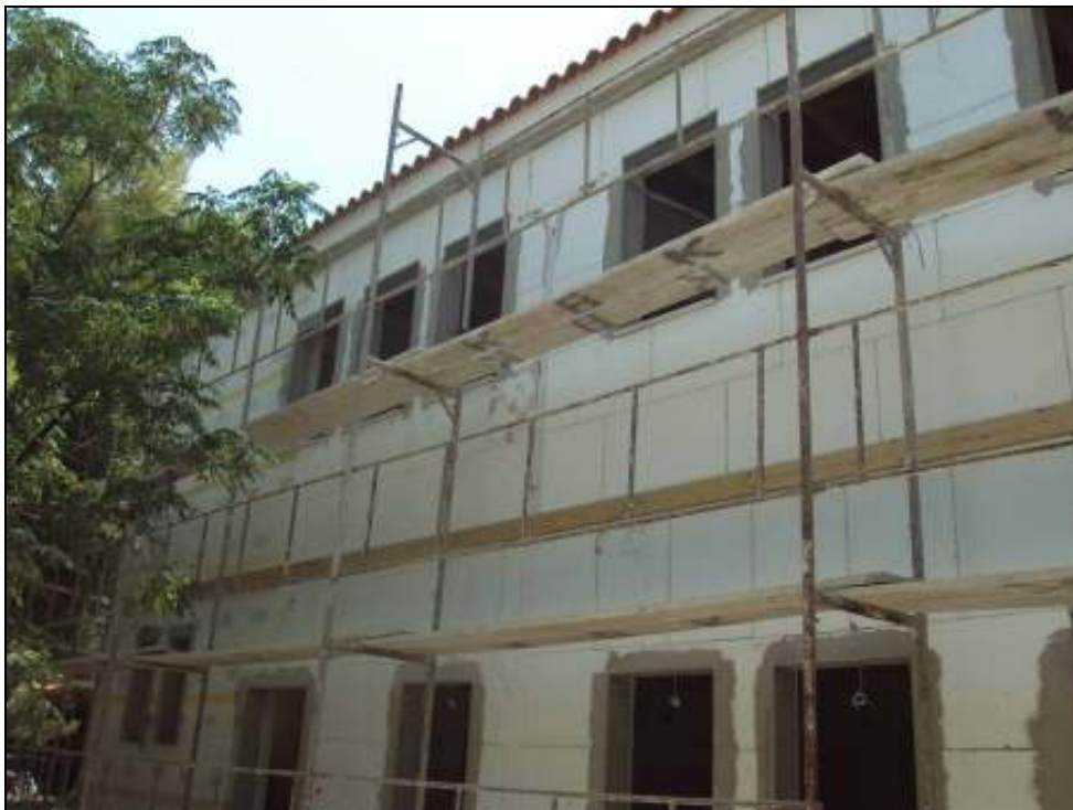
External Thermal Insulation System – 25th EBA