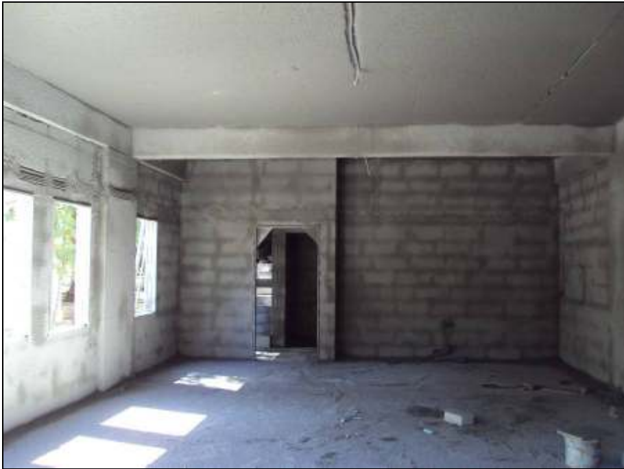
Coating _ 1st phase – 25th EBA