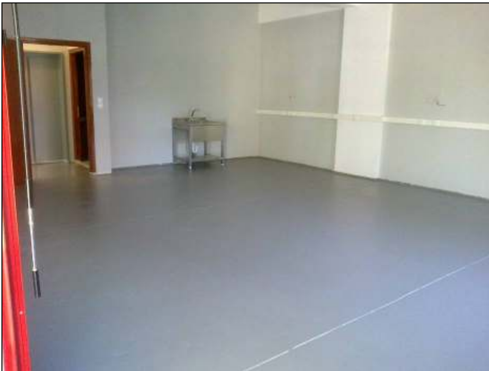
Ground floor Laboratory – Storage House of 25th EBA