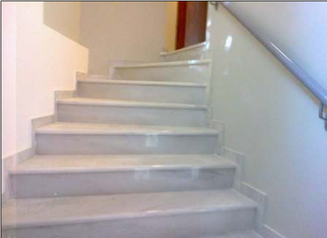
Staircase – Storage House of 25th EBA