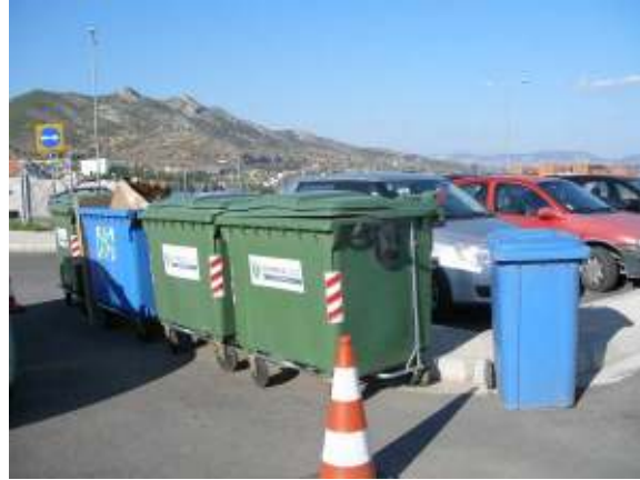
Nea Peramos OMC