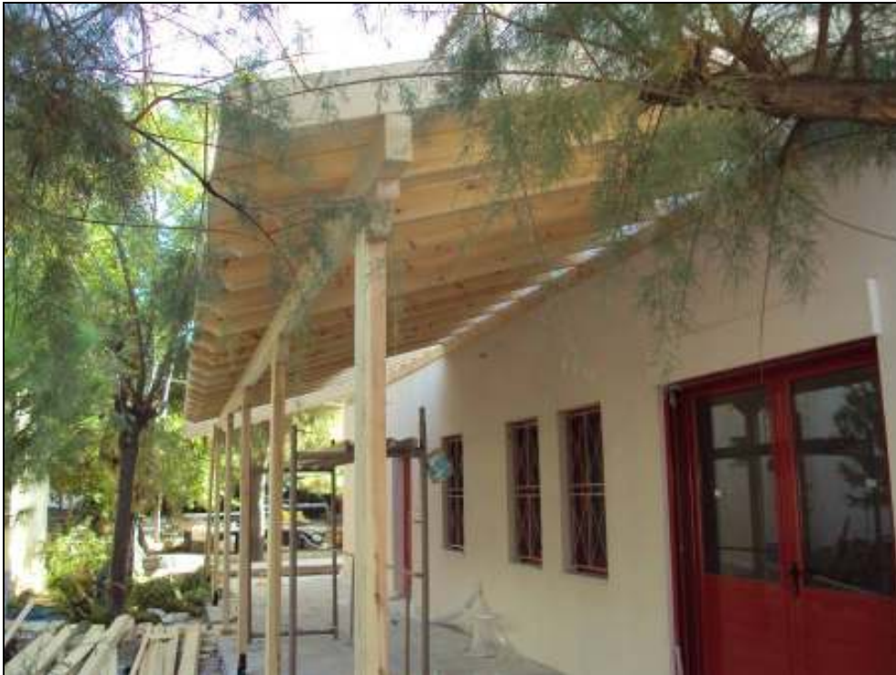
External ground roof – Storage House of 25th EBA