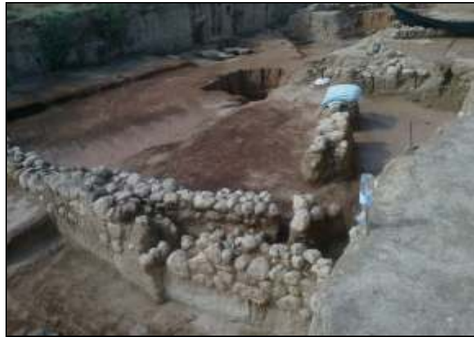
SIKYONA (MOULKI) K.P. 17+100 KO-PA section Architectonical ruins excavation

Works in the positions indicated in the Concession Agreement (article 13.1) and where there is a great potential of Antiquities being revealed have commenced.