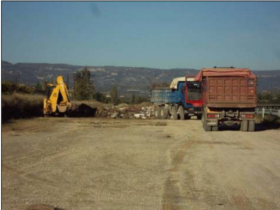
Cleaning of garbage at GU16 (k.p. 95+100)