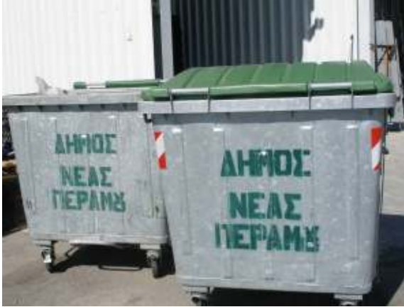
Nea Peramos OMC

The respective “Hazardous Materials Selection and Procurement Procedure” has been prepared describing all the constructor’s actions contributing to the prevention of the uncontrollable use of hazardous materials during the Project’s construction period.