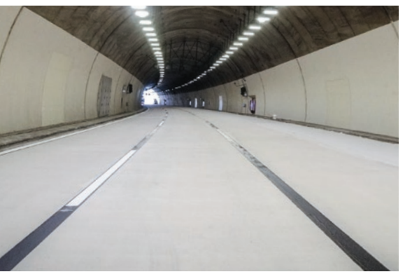
6. The final "product"