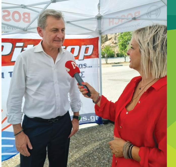
The Chairman and Chief Executive Officer of Olympia Odos at the "Road Safety Pit Stop"