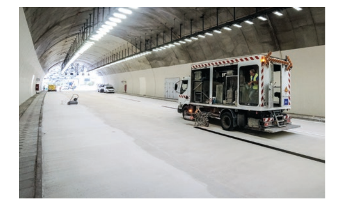
5. Application of a special marking

Important results are expected also in the field of road safety, where the light-colored surface of the pavement is expected to create a more comfortable driving environment. For the same reason, additional reflective equipment (cat's eyes) every 10m along the curbs on both sides of the tunnel, while to keep the necessary contrast between the lane marking and the new light-colored pavement, a combination of a black boxed marking with a broken white line inside it will be applied.