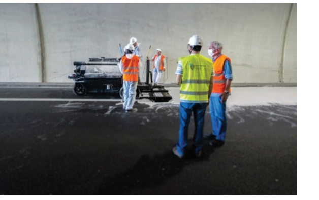
3. Application of the material using special machinery