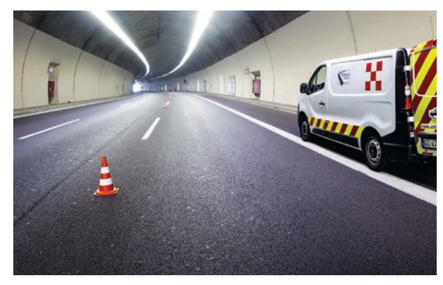
1. Measurements before the application of the coating

This practice has a double environmental impact and arises from the energy consumption cuts and from the prevention of pavement replacement, both resulting in the decrease of carbon emissions, while it complies with the environmental policy and the commitments of the shareholders of Olympia Odos (VINCI Concessions, Hochtief PPP Solutions, AVAX, TERNA, and AKTOR) regarding the climate and the circular economy.