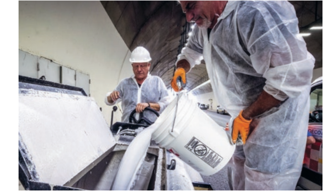
2. Mixing of the components of the coating