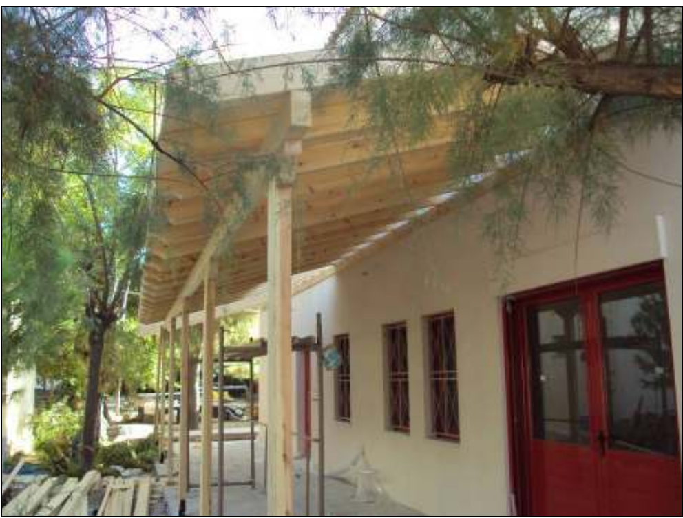
External ground roof – Storage House of 25th EBA