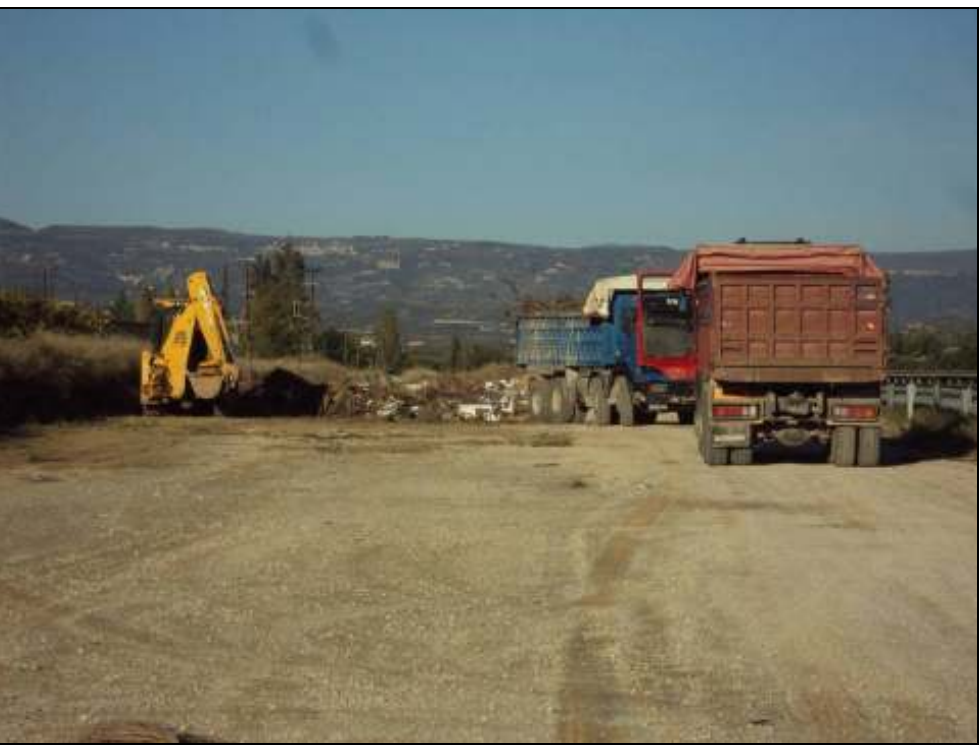
Cleaning of garbage at GU16 (k.p. 95+100)