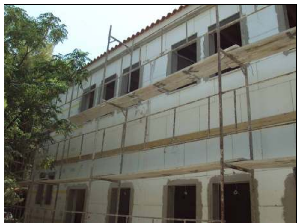
External Thermal Insulation System – 25th EBA