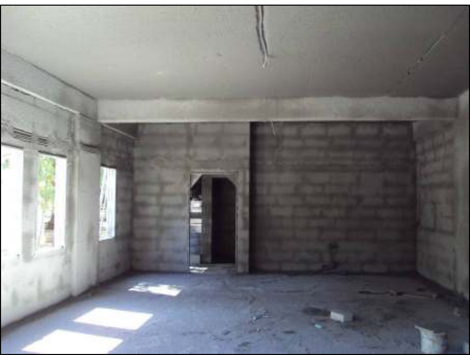
Coating _ 1st phase - 25th EBA