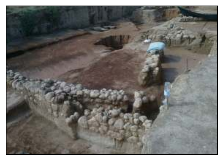
SIKYONA (MOULKI) K.P. 17+100 KO-PA section Architectonical ruins excavation

Works in the positions indicated in the Concession Agreement (article 13.1) and where there is a great potential of Antiquities being revealed have commenced.