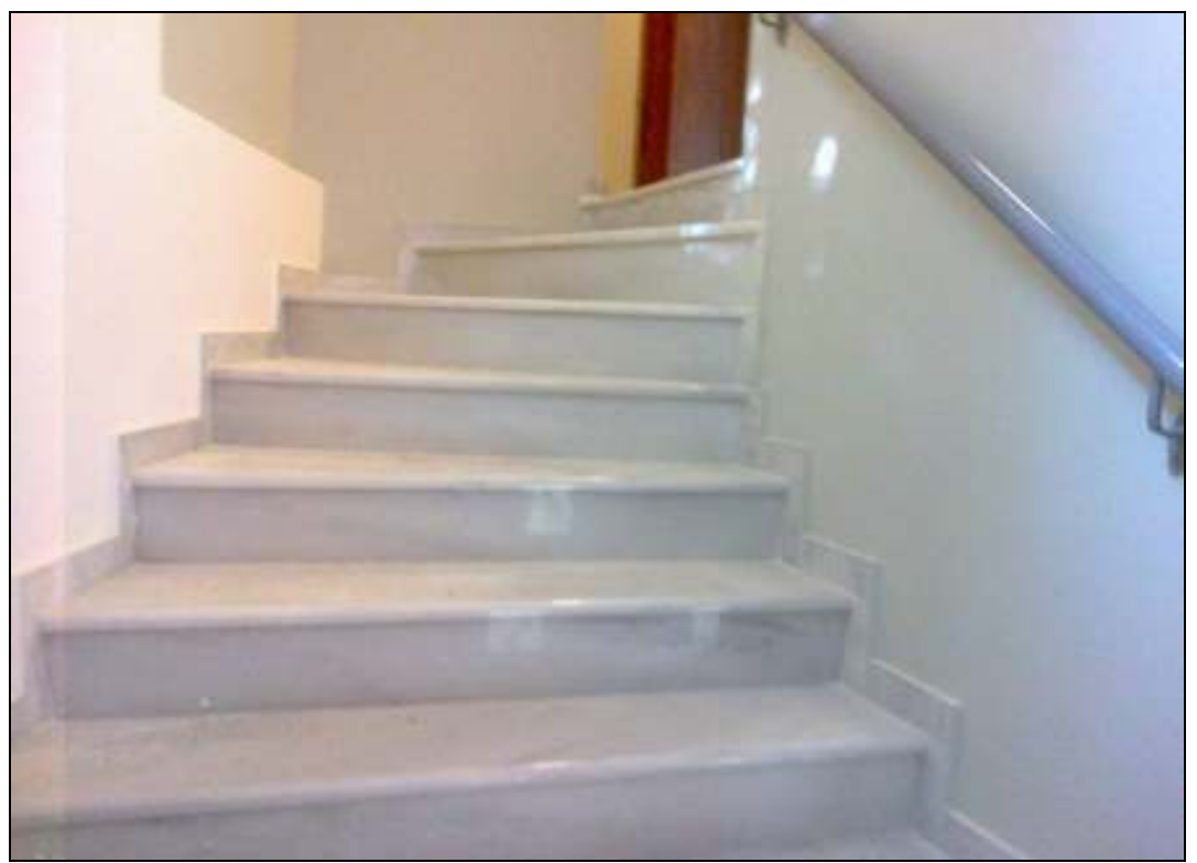
Staircase – Storage House of 25th EBA