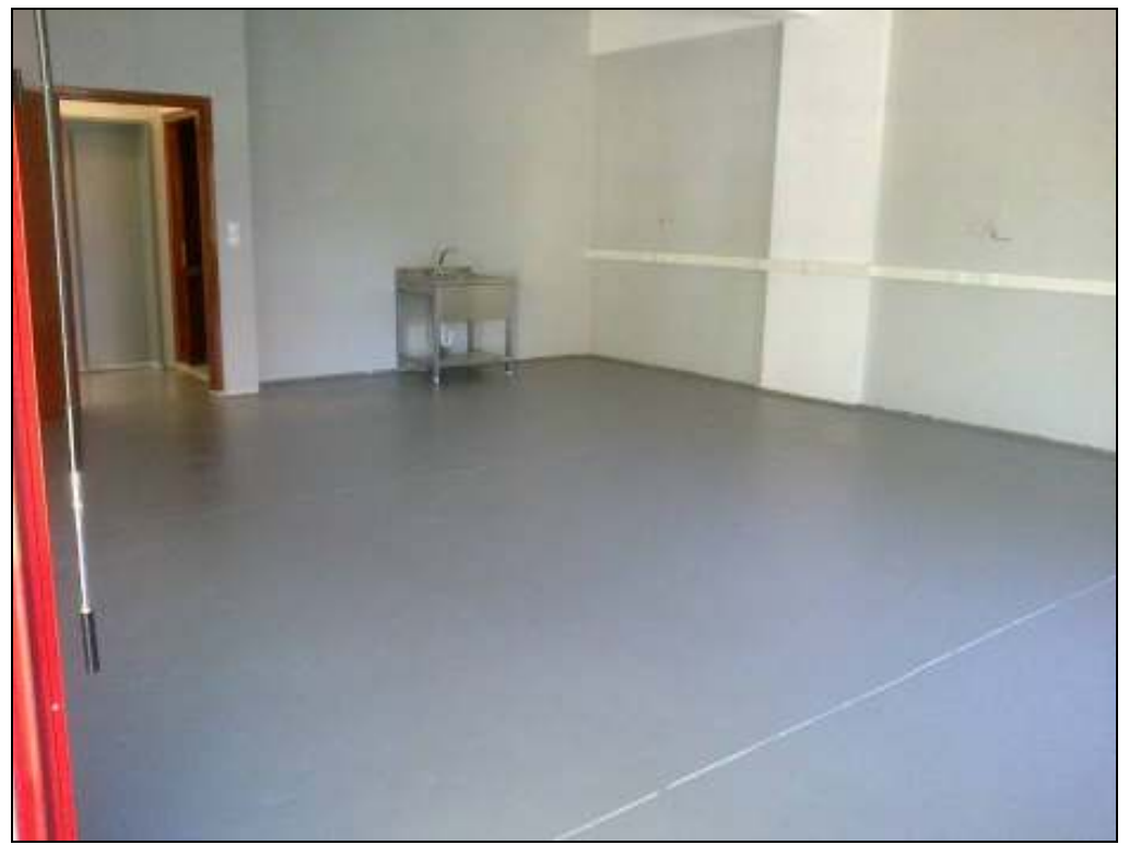
Ground floor Laboratory – Storage House of 25th EBA